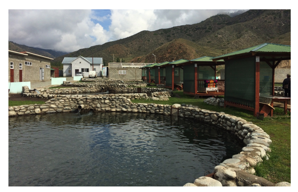
Fig 3. Ala-Balyk Trout Farm (showing sheltered kiosks on right hand side where patrons can eat fish from the pens).