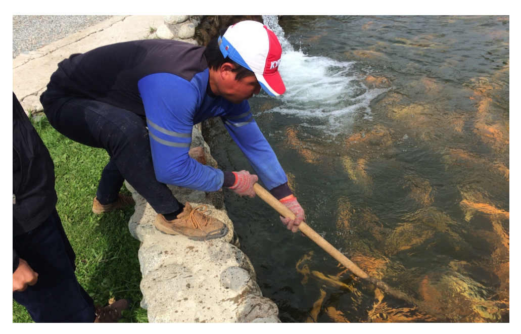
Fig 4. Worker netting trout for customers to consume on-site at Ala-Balyk Trout Farm. (Photograph by Philip Hayward, October 2019.)

The IKBR identified no particular view concerning future use of the lake once/if native fish stock are substantially restored to us, identifying the restoration activity as their prime concern and leaving the management and regulation of leisure and/or commercial fishing to the regional and national authorities to decide. One thing that was evident from interviews with IKBR personnel, fish farm operators and managers is that the maintenance of the lake and surrounding region as an under-developed and minimally damaged environmental system is seen as important and as a source of