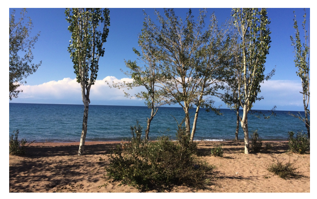
Fig 2. View north from south side of Issyk-Kul, near to Kadzhi-Sayskiy Plyazh.

There is an absence of (operating) high-end resorts on the southern shore of Issyk Kul and the area is generally underdeveloped and more peaceful than the north (Fig. 2). On this side of the Lake, there is a greater emphasis given to more low-key types of tourism such as ecotourism and jailoo tourism, which involves staying in summer pastures that surround the Lake. Furthermore, while developed areas of the northern shore are dominated by tourists from the former USSR (principally from Russia and Kazakhstan), local informants suggested that the southern shore seems to appeal more to tourists from Europe and North America (a proposition that requires further research). This may be interpreted as evidence of the dichotomy that Palmer (2009) identified as "a dilemma over attempting to maintain ties with Soviet era Central Asian neighbours versus becoming an independent nation within a wider international community" (2009: 193).